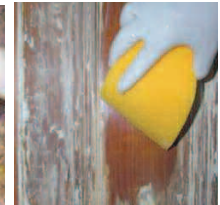
Clean & Neutralize